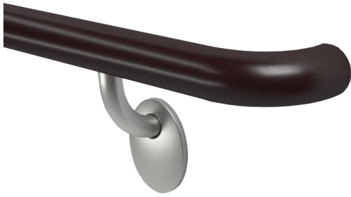
900M WITH 909SS STAINLESS STEEL BRACKET