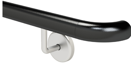
900M WITH 909SS STAINLESS STEEL MRND BRACKET