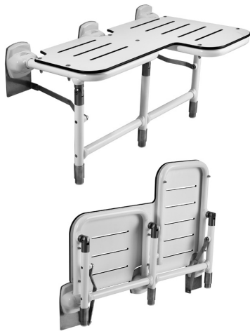
Bariatric folding shower seat with legs

Code DSGBSSLBAR-PH Series Vinyl Coated Tub & Shower Seats