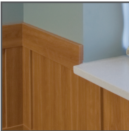
Factory Finished Edge