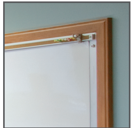
Accent Trim Pieces