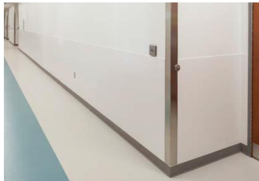
Prism Wall Panels