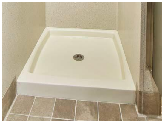
Prism Shower Receptor

Prism sheet material is a protective wall covering for any place more susceptible to water contact and bacteria growth such as kitchens, washrooms, and hospitals. Prism partitions can be used for to either separate toilets or showers, with a non-porous surface that will stand up to mold and mildew. Prism Shower Receptors are used as shower bases in a variety of commercial buildings.